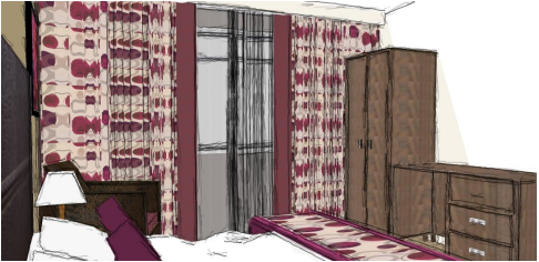
DOUBLE ROOM PACKAGE PRICING EXAMPLES